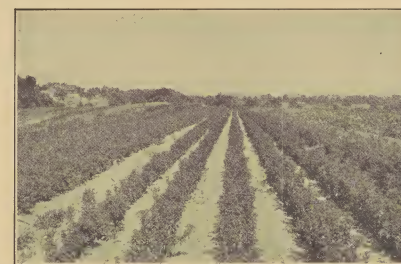
PUSH THE PLEASURE IN THIS CONTINUOUS-BLOOMING DWARF

Per 100 1½ to 2 ft. .... $20.00 2 to 3 ft. .... 30.00